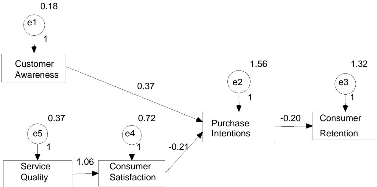
Figure 3. Structural equation modeling of CSR, consumer satisfaction and consumer retention.

this purpose a leading cellular company was selected, having high level of CSR activities in Pakistan. The study found very low awareness level in customers regarding CSR activities. No linkage was found CSR activities and customer purchase intentions. This depicts that customers in Pakistan do not consider corporation's contribution towards society in their buying decisions. Significant relationship was found between service quality and customer satisfaction. Service quality also included reasonability and variety of pricing schedules, call clarity, network coverage. It shows that customer pay more attention to pricing strategies than CSR activities of service providers. No relationship exists between customer satisfaction and purchase intention and customer purchase intentions and consumer retention. It means that customer in cellular looks towards best packages of service providers and do not build strong and long-term associations with corporations rather they often look towards better options to enjoy best packages on more cheaper rates.