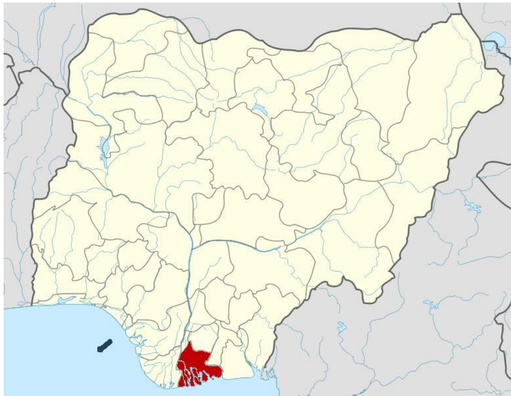
Figure 1. Map of Nigeria showing Rivers State.