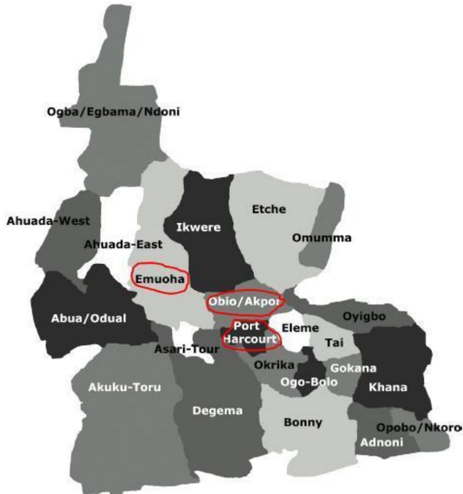
Figure 2. Rivers State showing all the LGAs with the study sites in red circles.