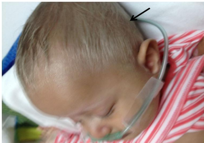
Figure 1. Oculocutaneous albinism and silvery hair.